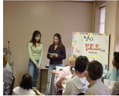
AR Drug Free Youth— Two students from Fordyce serve on Statewide board

On February 8 two Fordyce High School students, who are members of Arkansas Drug Free Youth (ADFY), gave a presentation to DASH members at their regularly scheduled meeting. The presentation, Youth Extinguishing