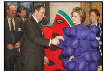
Governor Huckabee is greeted by teachers at Union Academy.