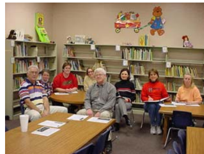
Child Advisory Committee in Fordyce