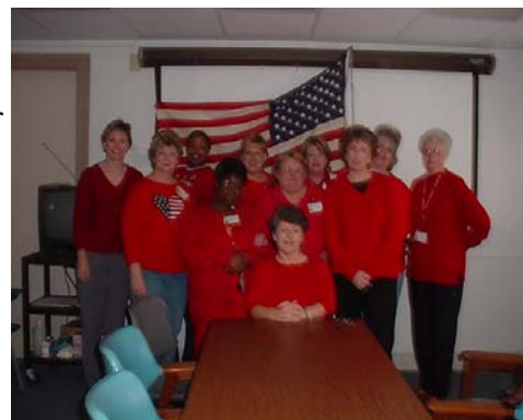
Miller County employees participated in Red Dress Day on February 4th.