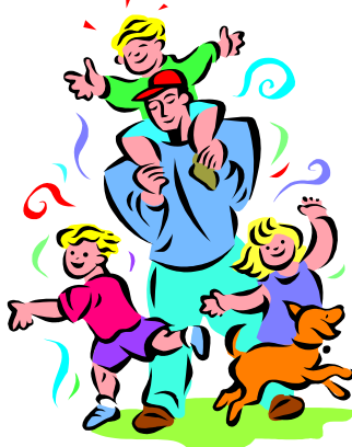
Public Health Weeks is a time for celebration.