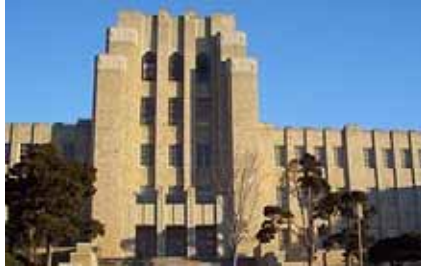
North Little Rock High School